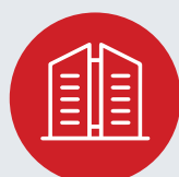
Low energy buildings