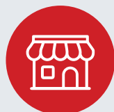
Small retail outlets

Changes to Part L of the building regulations ensure that Rinnai A series water heaters are ideal for the sectors specified above. These include modular buildings with a service life less than 2 years, hire and event services, glamping pods and buildings with 50m 2 of useable space.