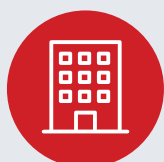
Modular buildings (Service life of less than 2 years)